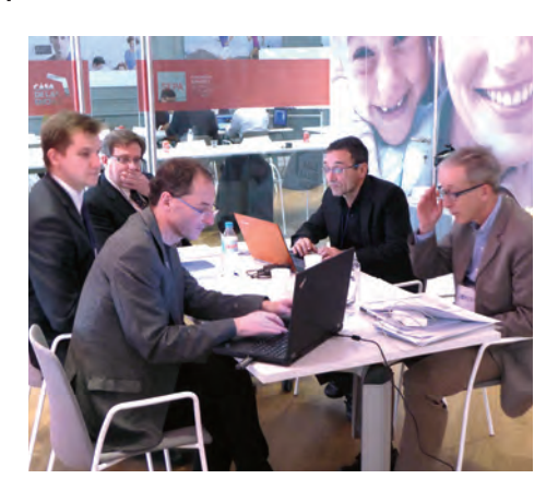
EFP and IDF participants at the Perio-Diabetes Workshop

Current evidence indicates that in people with diabetes, periodontal therapy accompanied by effective self-performed oral hygiene at home is both safe and effective – even in people with poorly controlled diabetes. Similarly, there is consistent evidence that periodontal therapy